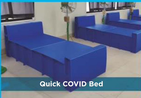
Quick COVID Bed