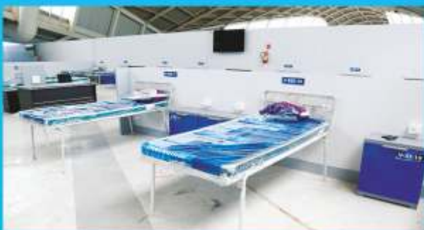
COVID Quarantine Bed

We have successfully supplied these products to major Municipal Corporations (MMRDA, NMMC) and hospitals across India.