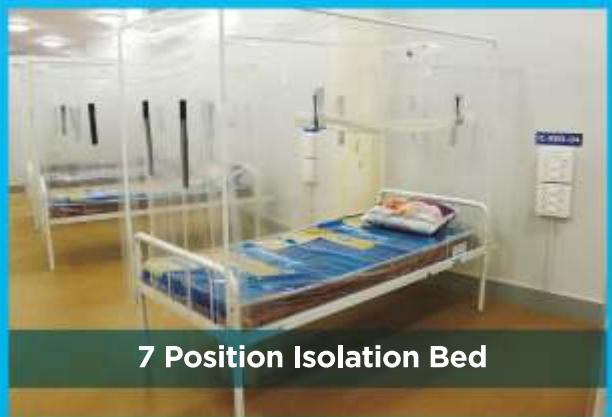
7 Position Isolation Bed