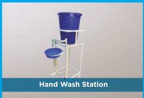
Hand Wash Station